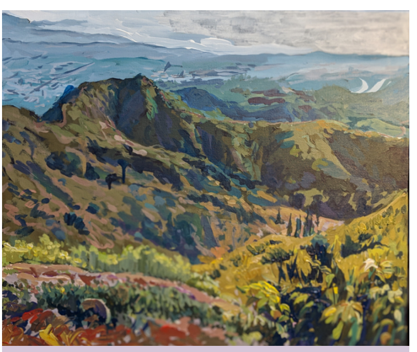
Painting by Roger—"From Mount Hollywood, Looking East"

The painting is something I did from a photo that I took from the peak of one of our local mountains. This scene is looking down on one of the trails, one of the many uphill climbs that we have to make to overcome some of life's problems.